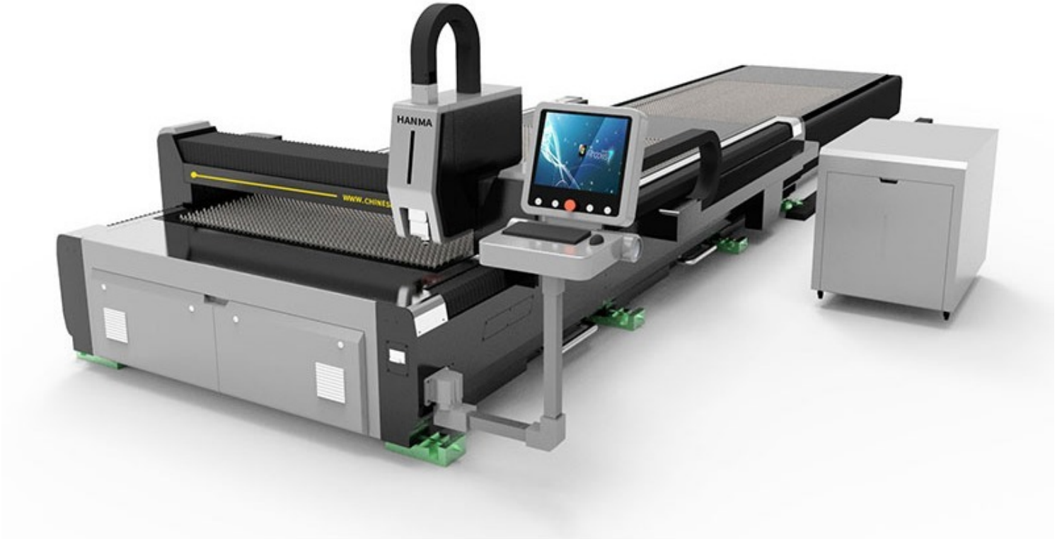
Laser cutting machine

What software is used for laser cutting machines?