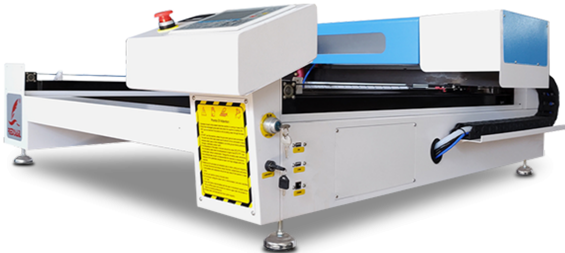
laser cutting machine