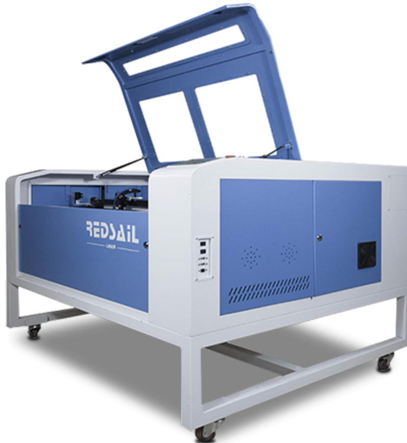
laser cutting machine