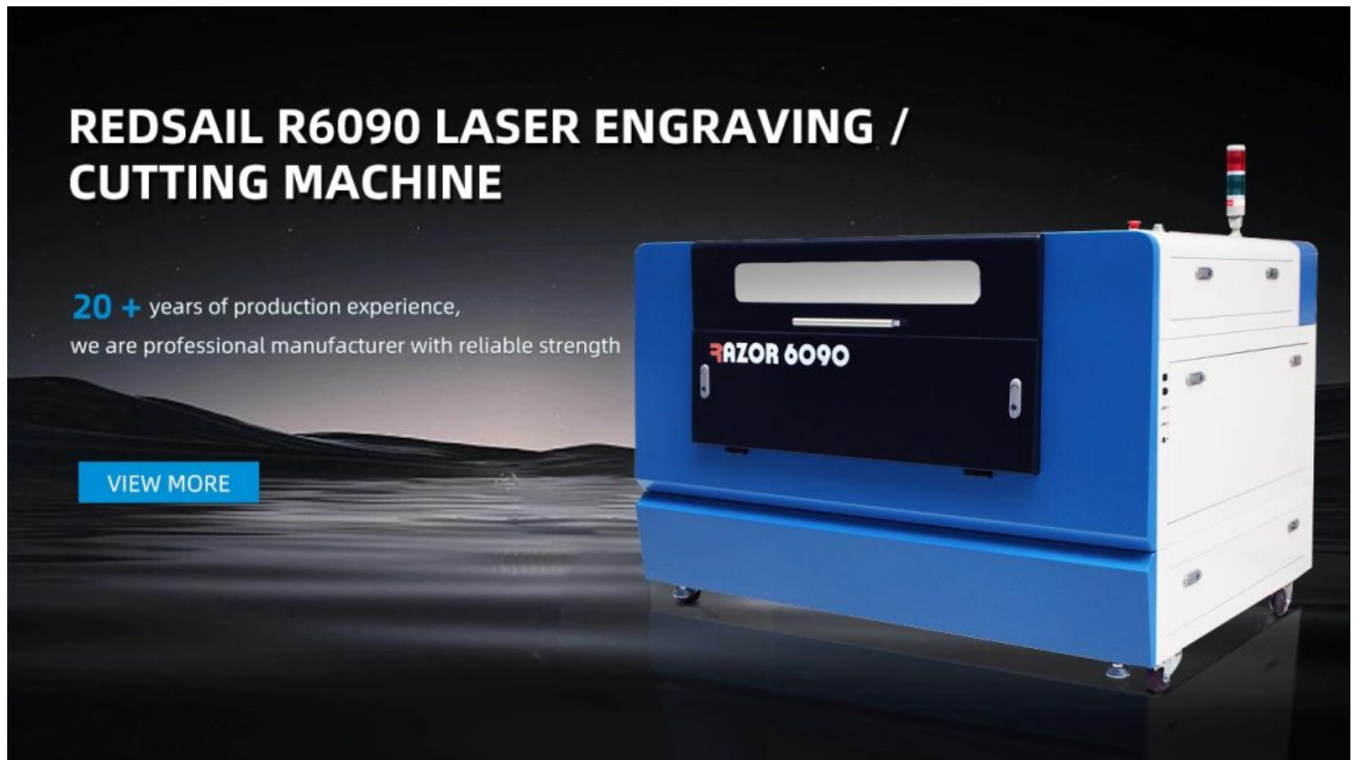
laser cutting machine

How much is a small laser metal cutting machine now?